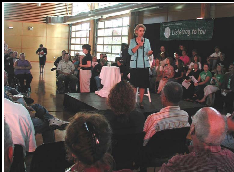
GOVERNOR CHRISTINE GREGOIRE TOWN HALL MEETING ON JULY 27TH AT THE PAVILION IN PUYALLUP