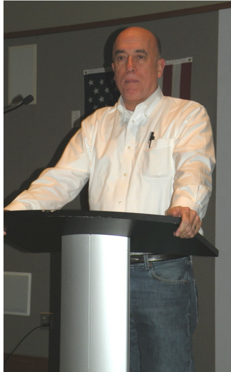
SPEAKER AT DECEMBER MEETING STATE DEMOCRATIC CHAIR DWIGHT PELZ

READ ALL ABOUT WHAT IS HAPPENING , WHAT DID HAPPEN, MINUTES PLUS UPCOMINGS ON PAGE 2 AND - - - - PAY YOUR 2010 DUES TODAY! SEE PAGE 6.