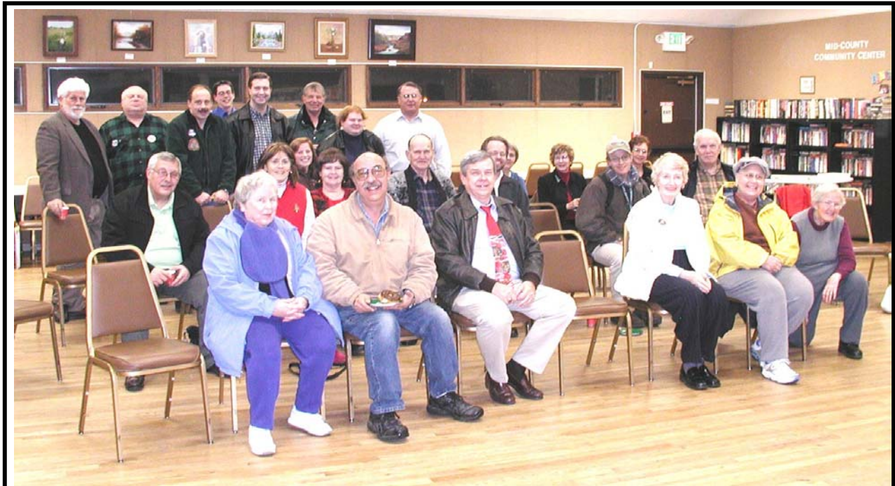
25TH LDD MEMBERS AT DECEMBER MEETING WISH THE REMAINING MEMBERS A