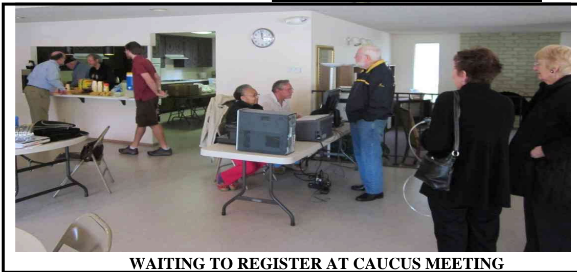
WAITING TO REGISTER AT CAUCUS MEETING