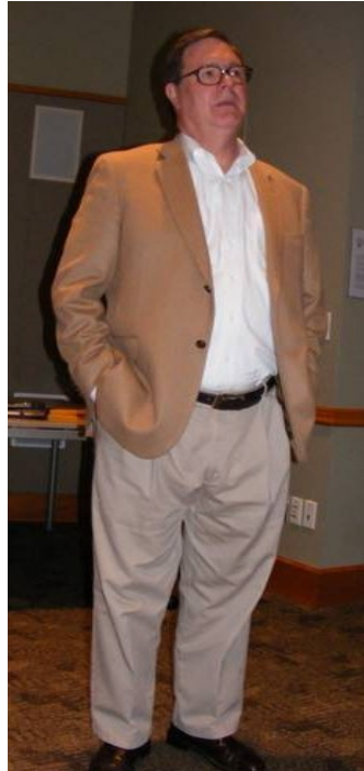
CONGRESSMAN DENNY HECK GAVE OUTSTANDING TALK AT 25TH LDD MONTHLY MEETING ON HIS INITIATION INTO WASHINGTON POLITICS